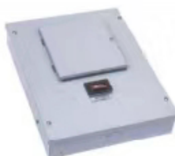
3 Phase 12 Lines