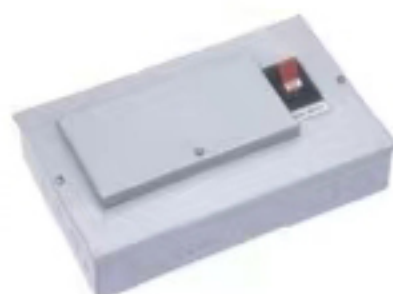
1 Phase 6 Lines