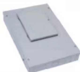
3 Phase 9 Lines