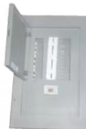
3 Phase 18 Lines