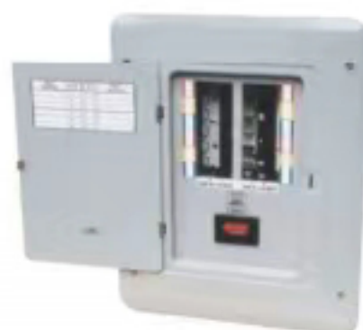
3 Phase 12 Lines