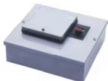
1 Phase 4 Lines

PD30-1M distribution system is suitable for circuit of AC 50/60 Hz, rated voltage up to AC 660V, rated current up to 125A of distributing control of modern building such as large office mansion, hotel, commerce department, industrial and mining enterprises and so on. It can protect electric appliances from overload voltage & current. It also can short and frequent switch ON/OFF under normal operating condition. It is one of the most reliable general distribution systems in the world. 1 phase 4lines, 6lines, 8lines, 12lines, and 3phase 9lines, 12lines, 18lines, 24lines, 36lines are available.