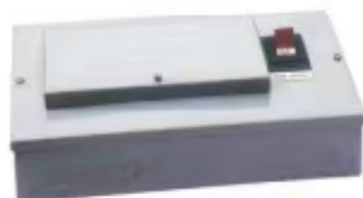
1 Phase 8 Lines