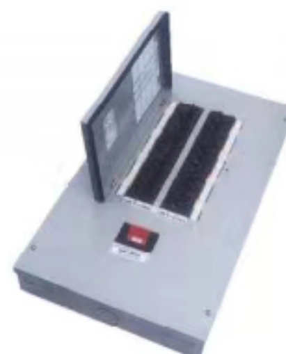
3 Phase 24 Lines